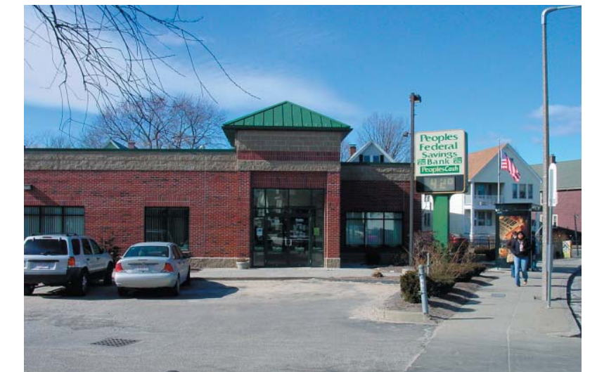
Peoples Federal Savings Bank

On March 4th, 2006, approximately 50 people gathered at the Honan-Allston Branch Library at 300 North Harvard Street, for a Placemaking Workshop facilitated by New York-based Project for Public Spaces, Inc. (PPS). The intent was for Allston residents to brainstorm ways the North Allston-Harvard relationship could be realized in a positive way through the public realm around Barry's Corner (the intersection of North Harvard Street and Western Avenue). The ideas will help inform the Allston Initiative planning process and Harvard's Master Plan.