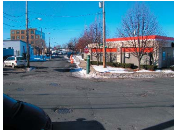
Spur Street looking West