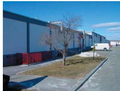
Facade of 219 Western Ave