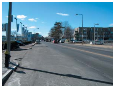
Western Ave looking towards Barry's Corner